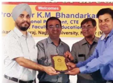
Guest being honored at national seminar.